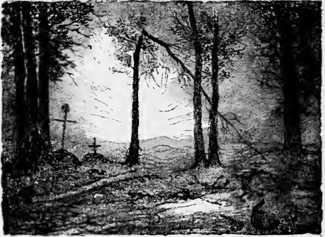
A HUGE BLACK CROSS STOOD FORTH IN THE SEMI-DARKNESS [Page 291]